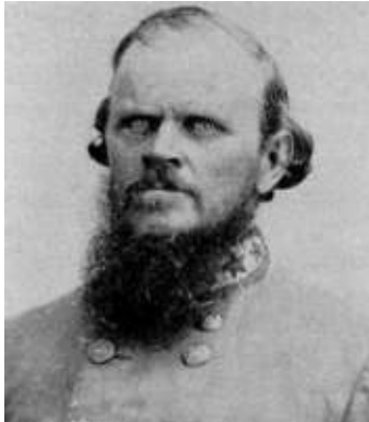
Brig. Gen. Nathan "Shanks" Evans, C.S.A. Confederate Commander, Ball's Bluff