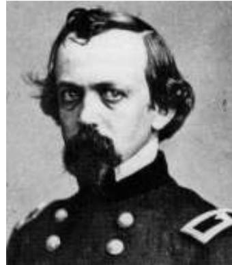
Brig. Gen. Charles P. Stone, U.S.A. Federal Commander, Ball's Bluff

Neshaminy State Park 3401 State Road Bensalem, PA Friday, April 29- Sunday, May 1, 2011