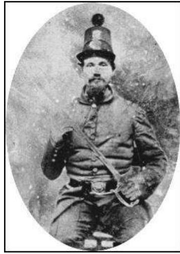
Col. Turner Ashby, C.S.A. Confederate Commander, Bolivar Heights